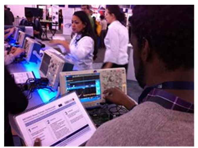
Tektronix Traveling Scope Bar

LocoLabs was not only able to see the MDO4000 in action during a tradeshow they attend annually but they were able to be hands-on and put it through the paces.